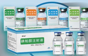
對比劑 Contrast Medium